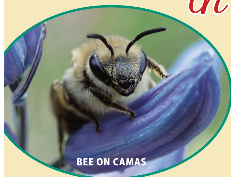
BEE ON CAMAS

Native Pollinators are essential to natural ecosystems. They help maintain healthy, productive native plant communities. Many animals, from birds to grizzly bears depend on insect-pollinated fruits and seed. Pollinating insects are a central part of the food web, being food themselves for birds, spiders, bats and fish.