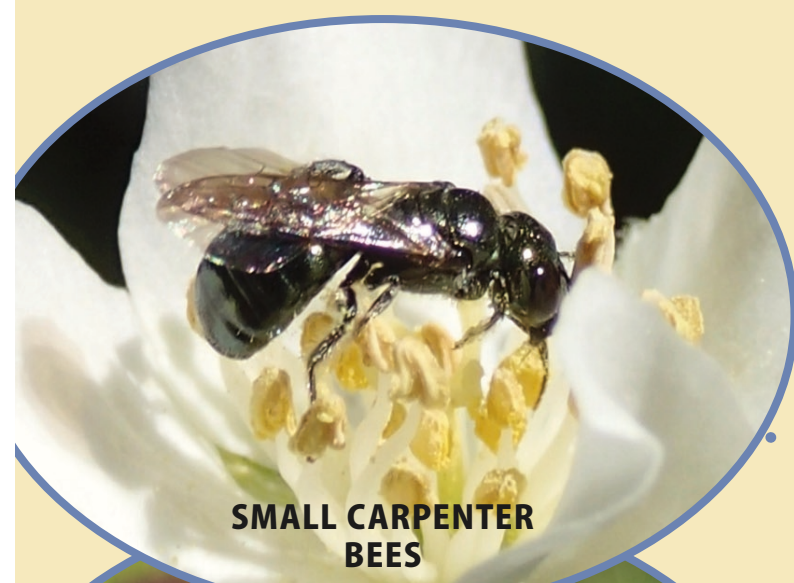
SMALL CARPENTER BEES